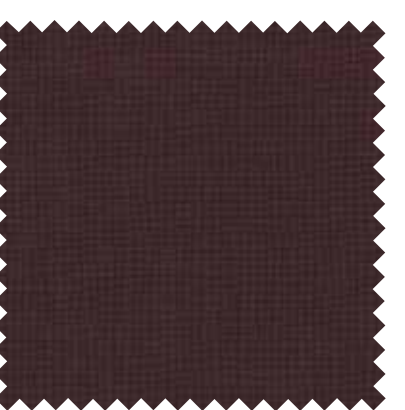
Nº 9437 16* Pansy