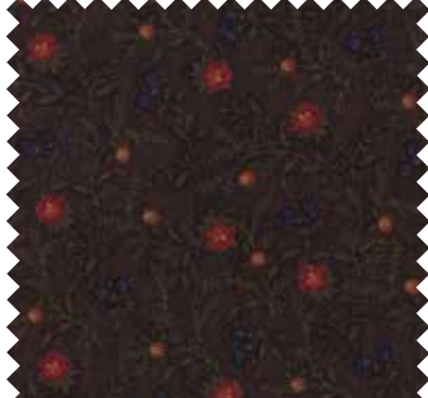
Nº 9431 16 Pansy