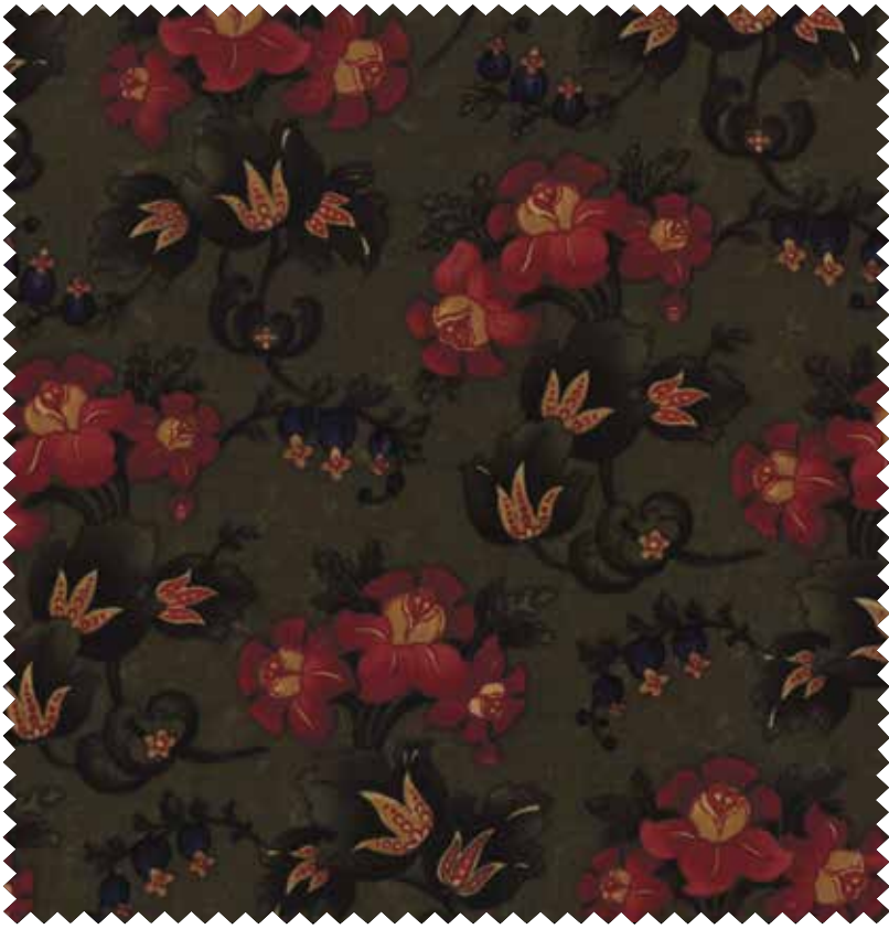
Nº 9430 13 Meadow