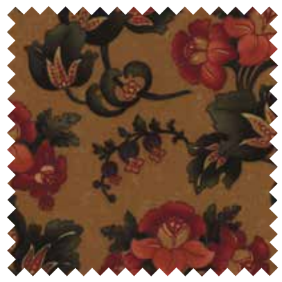
Nº 9430 12 Goldenrod