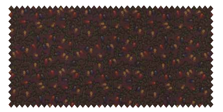
№ 9433 16* Pansy