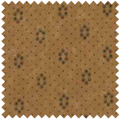
№ 9435 11 Tan