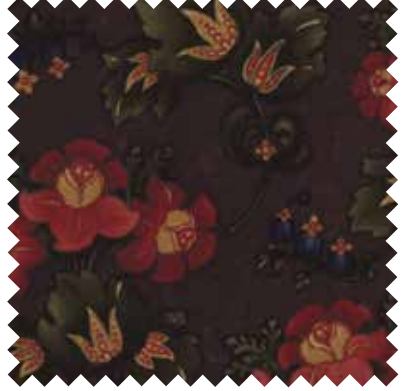
Nº 9430 16 Pansy