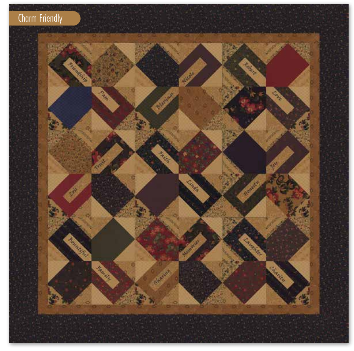
KT 55020/KT 55020G Best Friends Size: 35"x35"