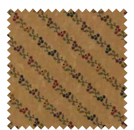
№ 9434 11* Tan