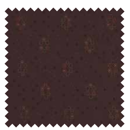
Nº 9435 16 Pansy