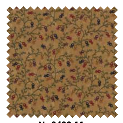
Nº 9433 11 Tan