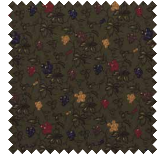
Nº 9432 13* Meadow