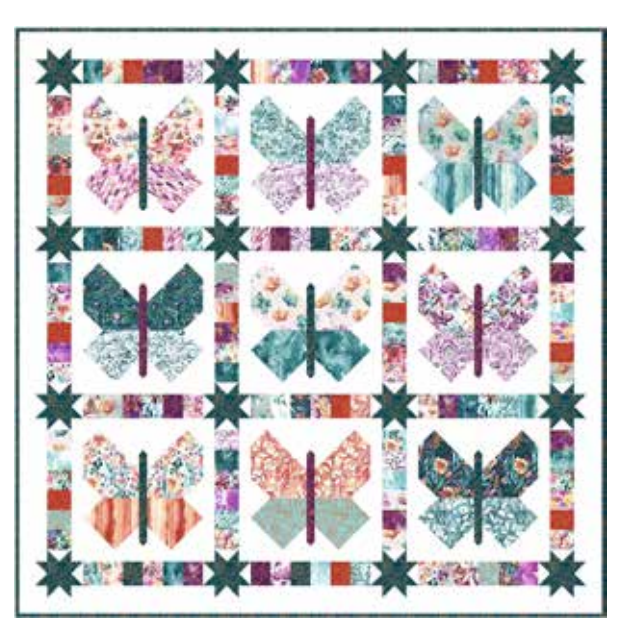
CJP 2006 Conservatory Garden 72" x 72" FQ Friendly