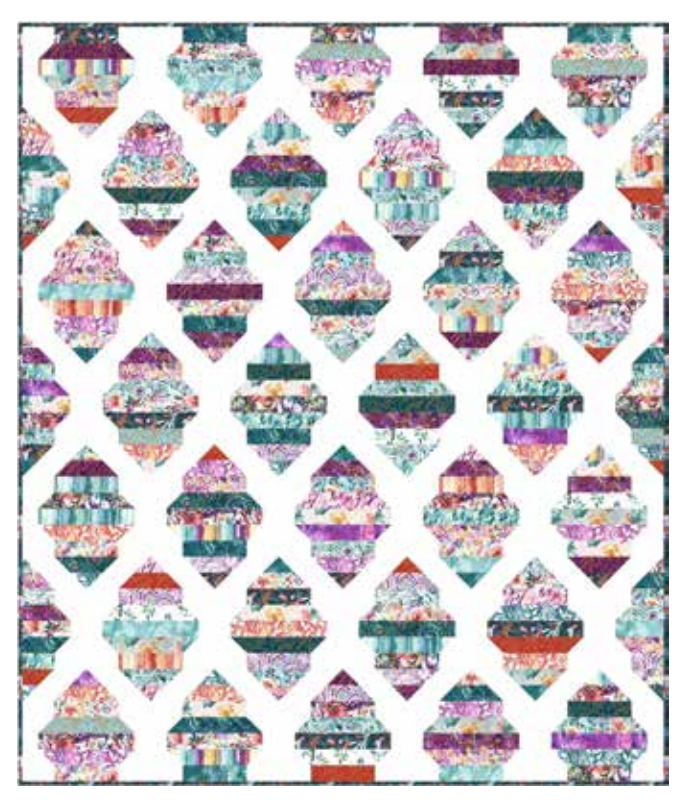
*CJP 2008 Metamorphosis Full Queen 80" x 94" JR Friendly