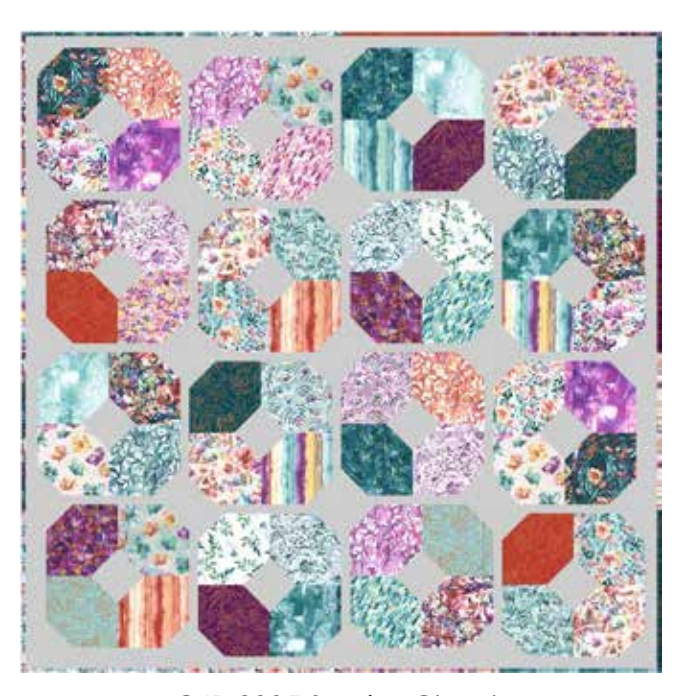
CJP 2005 Sunrise Clouds 79" x 79" FQ Friendly

*See website or sales professional for additional sizes!