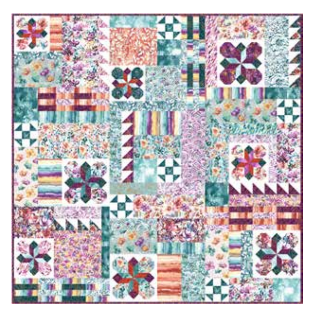
CJP 2007 Wildflower Fields 72" x 72" FQ Friendly