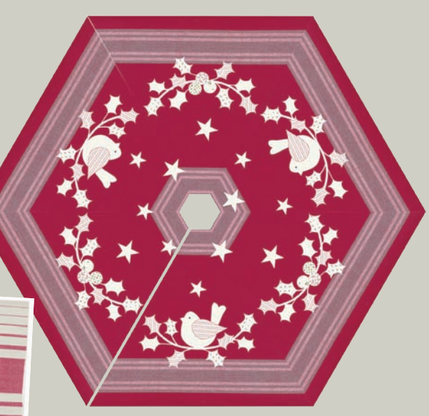
PTT 248 Snowbird Tree Skirt 40" Diameter