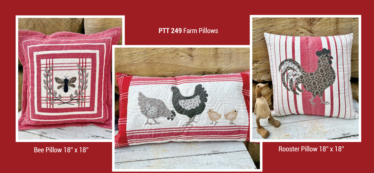
Hen And Chick Pillow 18" x 32"