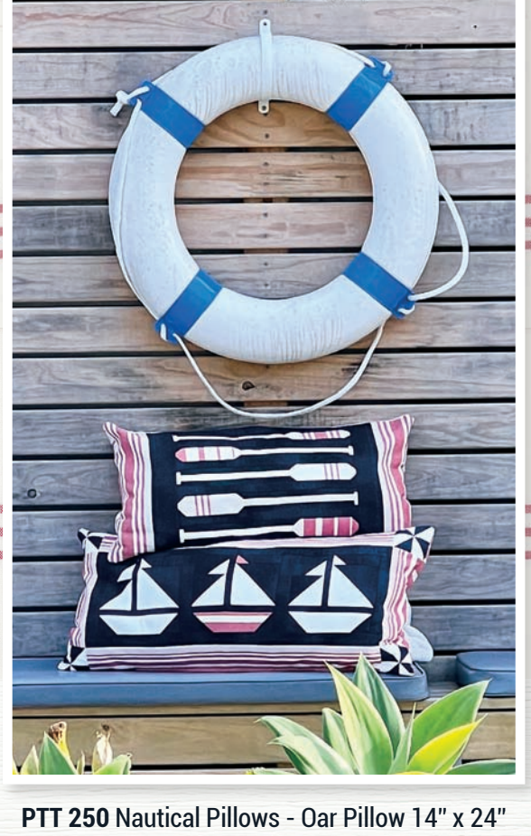
PTT 250 Nautical Pillows - Oar Pillow 14" x 24' Sailboat Pillow 14" x 29"