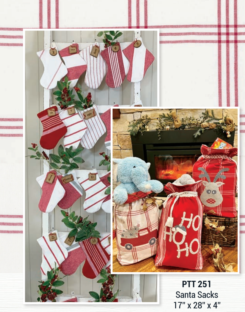
PTT 230 Mini Christmas Stocking 6" x 8"