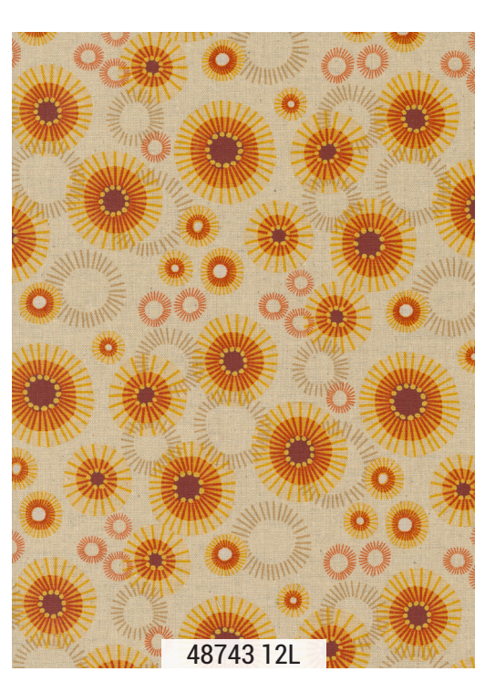
Mochi Linen Canvas are not included in the assortments and precuts.