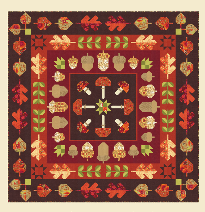
RPQP OGS151 Oak Grove Square Dark Version 72" x 72" Light Version also available