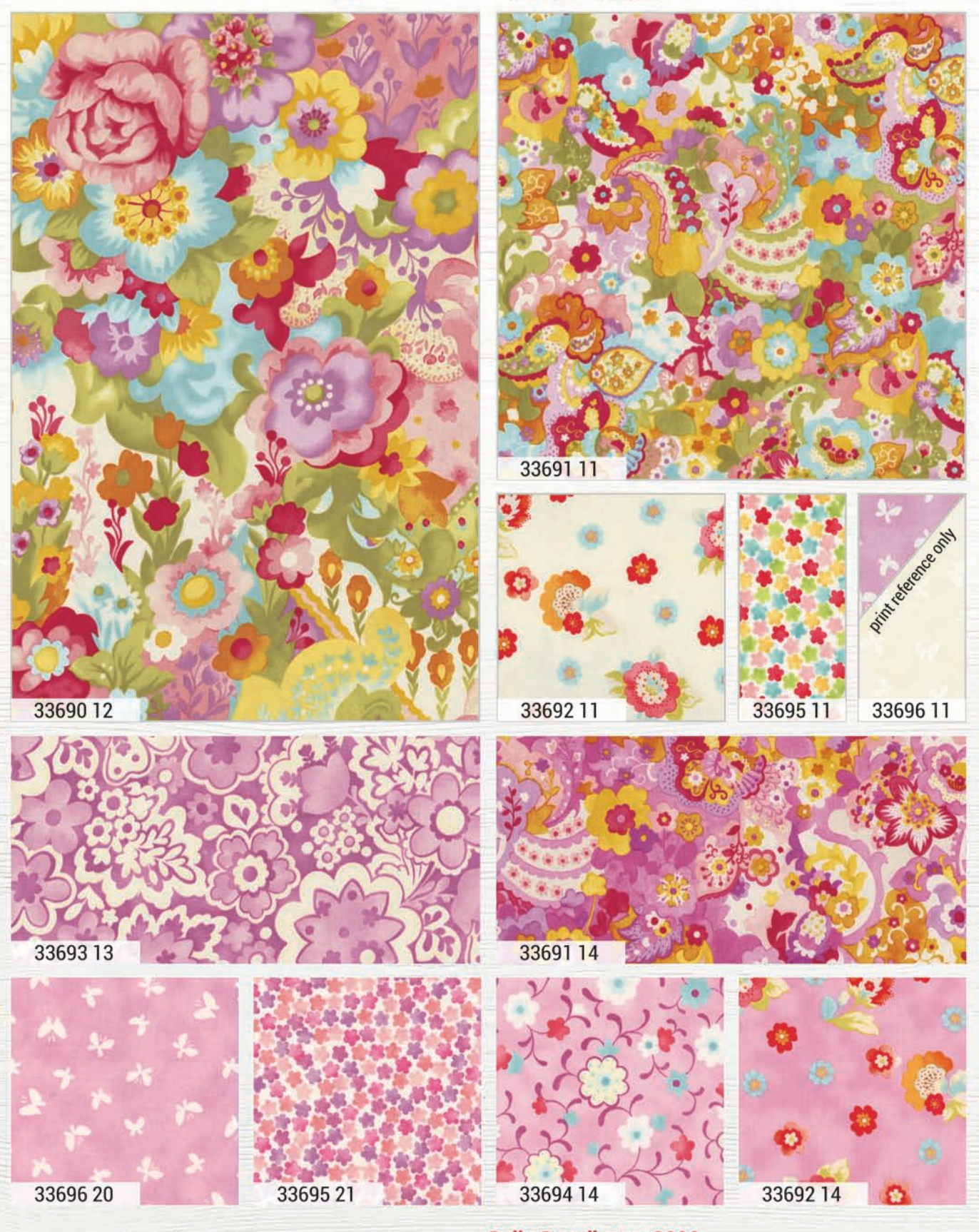
Bella Coordinates 9900