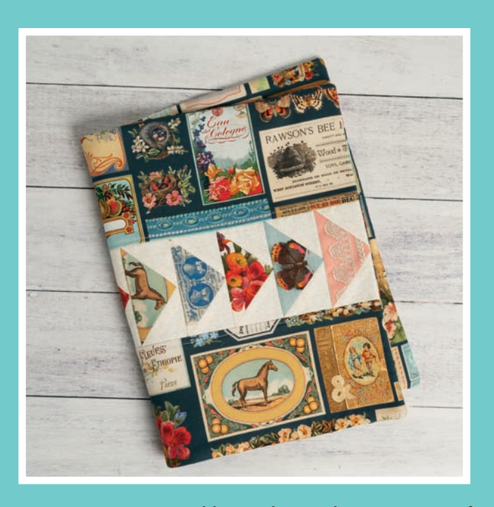
FREE PATTERN Composition Book Cover by Susan Strumpf pattern available for download on robinpickensinc.com