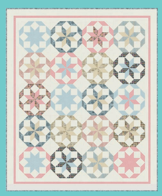
PS7410 Diamond Stars 70" x 84"