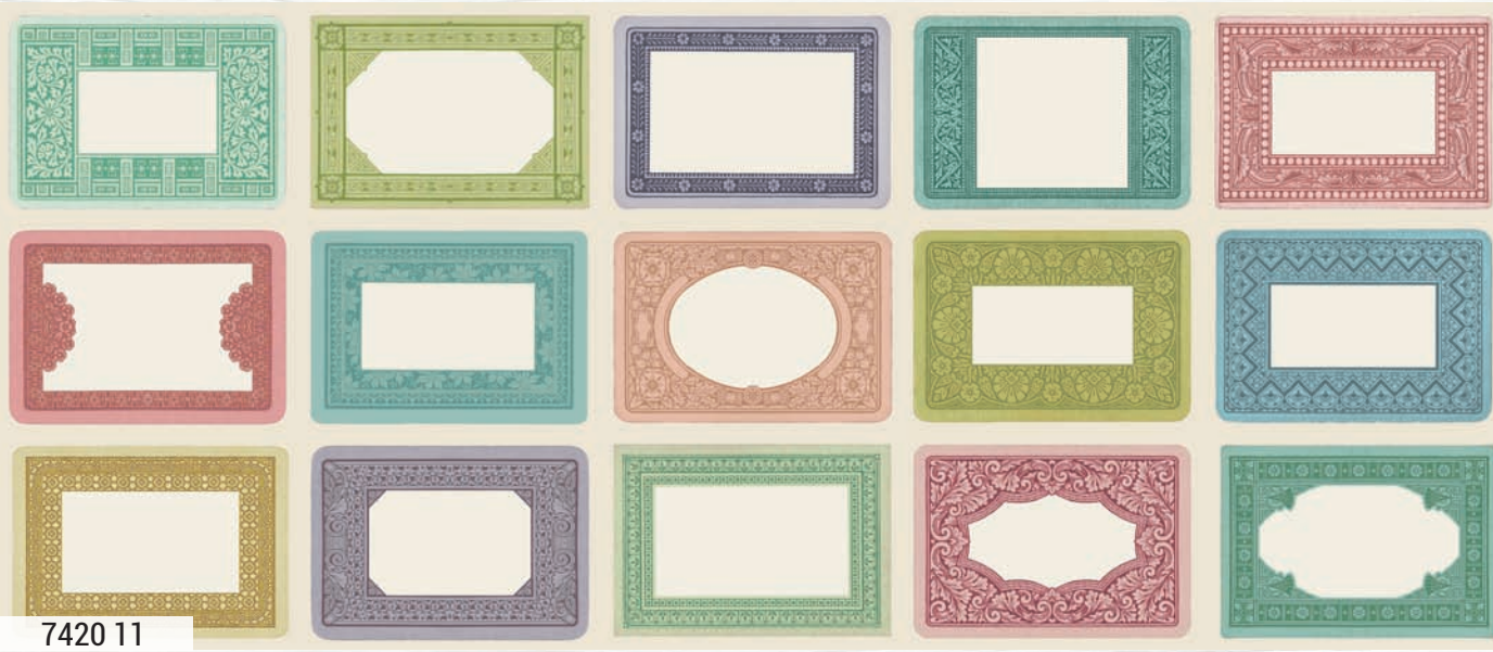
Playing Card Labels. Cards are approx. 4" x 2.75"