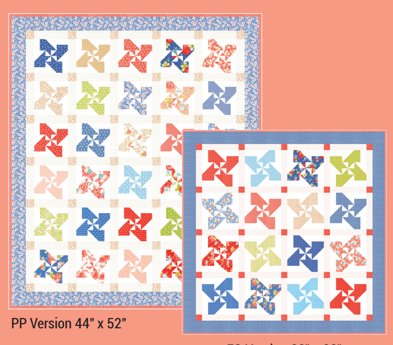
FQ Version 66" x 66"

FT 3002 Pinwheel Parade 59" x 70" 3 Versions Available (3rd option not pictured - LC Version 59" x 70")