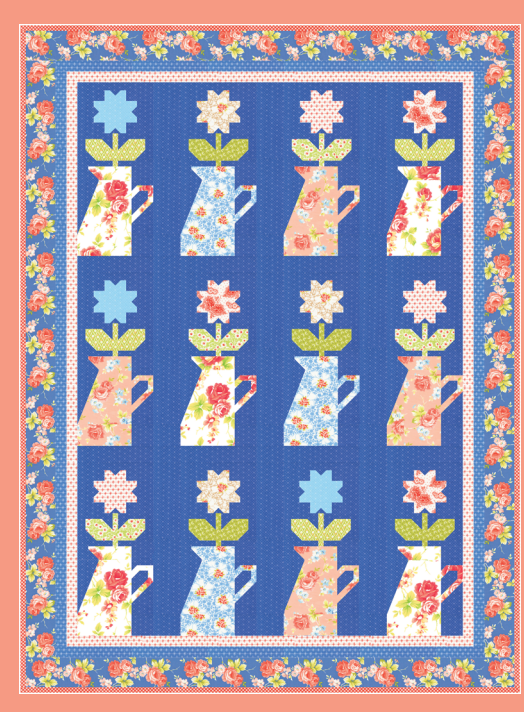
FT 3003 Milk & Blossoms 45" x 61" Also available in cream background

FT 3002 Pinwheel Parade 59" x 70" 3 Versions Available (3rd option not pictured - LC Version 59" x 70")