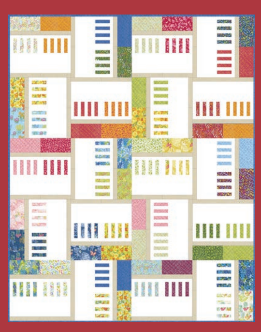
RPQP W146 Weaverly Twin 72" x 90" LC Friendly