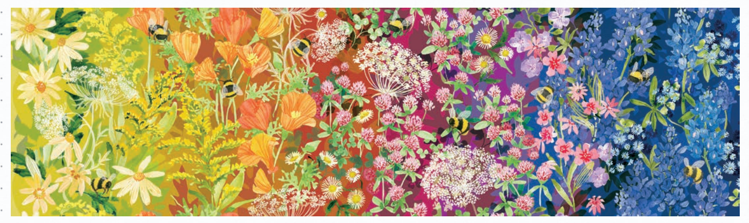
48730 11* 12" x-44" Repeat - 15 yd Put Up