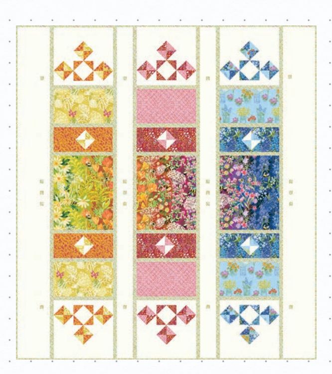
RPQP JT147 Joyful Trio 60" x 67'

Whether it is a field strewn with goldenrod or Queen Anne's lace adding splendor to the land-scape, the range of textures and colors from these wild blossoms is a delight. Bumblebees visit the pink clover and bluebonnets stand tall with pride. Orange poppies dance with yellow daisies. With Wild Blossoms, I wanted to show the rainbow of colors in a big width-of-fabric print. This ombre panel (12" continuous repeat) blends from color to color along the rainbow, with our busy bees visiting along the way. The WOF print allows you to use it in one big stretch as the rainbow, or cut it up to have fun with all the colors and flowers as you choose. I truly thought of this as a symphony of color with wildflowers.